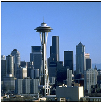
2012 Proposed Conference Seattle, Washington

As we progress further into FY12, the LESO continues to affect internal changes, on behalf of our customers, to make the program work to its full potential. We truly appreciate the honest feedback and look forward to making the 2012 National Conference in Seattle, Washington an even greater experience for our guests.