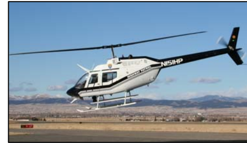
OH-58 Montana Highway Patrol

The Aircraft Lead has a close working relationship with the Military Item Managers. Please do not go directly to the Item Managers for information about aircraft coming available. Please call the Aircraft Team for all questions. If we do not know the answer, we will find out for you. The Aircraft Team continues to build relationships with strategic partners to better serve the airborne law enforcement community.