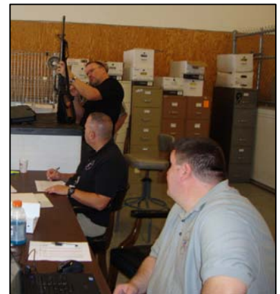
LESO Personnel Conducting On-Site Physical Inventory of Weapons

Input from the State Coordinators and LEAs have proved a great asset toward making LESO a World Class Federal organization. The ability to respond and adapt to the needs of the customers is a reflection of the dedication to the men and women of law enforcement. Please keep up the great work and please continue to give feedback.