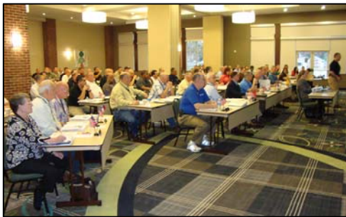
Representatives from Across the Country Attend the 11 th Annual DLA Law Enforcement Support Conference in San Antonio, TX

The Defense Logistics Agency (DLA) Law Enforcement Support Office (LESO) hosted our 11th Annual National Conference March 15-17 in San Antonio, Texas. The 2011 Conference hosted 122 attendees, an 11.9% increase from 2010 and a 71.8% increase since 2009. Our annual conference meets Congressional (10 USC § 380) and regulatory requirements (DLAI 1111 and DLA to State/Territory MOA). In attendance were State Coordinators (SC) and State Points of Contact (SPOC); strategic partners to include, but not limited to: Office of the Assistant Secretary of Defense (OASD), US Army Unmanned Aerial Systems (UAS), US Army Tank-Automotive and Armaments Command (USA TACOM), Bureau of Alcohol, Tobacco, Firearms and Explosives (ATF), NAVSEA Crane; as well as members of the national law enforcement community such as the National Sheriff's Association (NSA) and the Airborne Law Enforcement