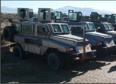
REVAs (Reliable, Efficient, Versatile, Affordable) Vehicles Reutilized through the 1033 Program