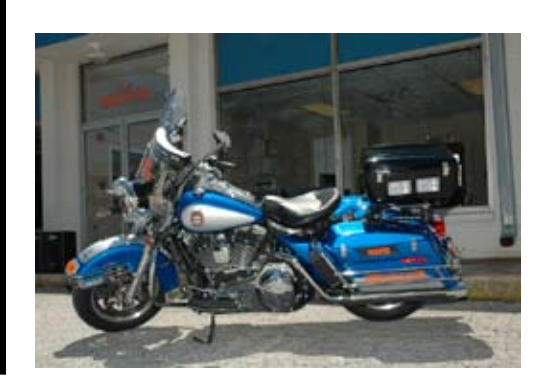
4 The Badge