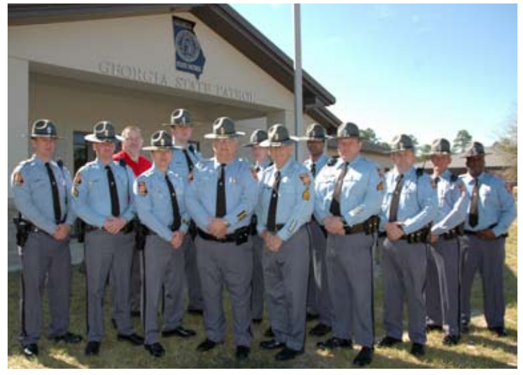
Post 46 Opens the Doors to its New Post Located in Monroe