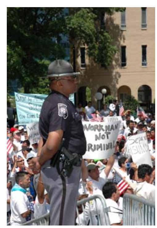
The Badge 5

With budget cuts, especially in the area of education, a large number of educators, citizens, and political action groups requested permits to address their concerns and their opposition toward these cuts.