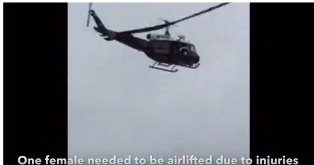
One female needed to be airlifted due to injuries