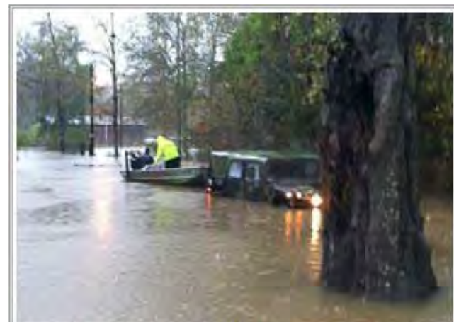
On a flooded road a Humvee acquired from DLA’s Law Enforcement Support Office launches a boat in Livingston Parish, La. The parish had acquired six Humvees just two weeks before the flood hit; during the flood 137 people were rescued using the vehicles.

“The program is awesome,” said the director . “You just don’t know how many lives you have saved.”