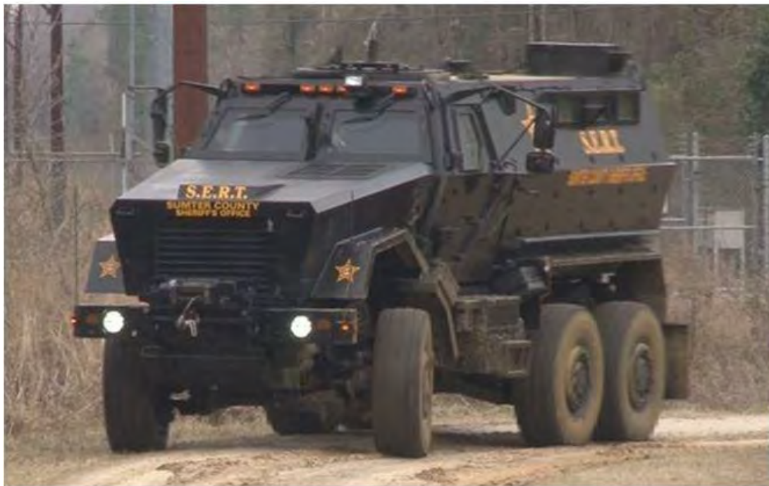
The Sumter County Sheriff's Office used their MRAP to train other departments throughout the state on Thursday

Link: http://www.wltx.com/story/news/2015/02/26/sumter-mrap-training/24085903/