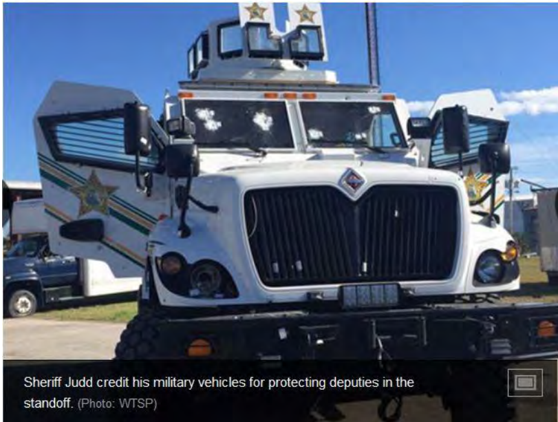
Sheriff Judd credit his military vehicles for protecting deputies in the standoff.

Link: http://www.wtsp.com/story/news/local/2015/02/06/man-fires-on-polk-deputies-sets-fire-to-building/23012479/