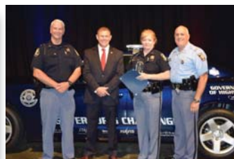
Motor Carrier Compliance Region 1 Second Place