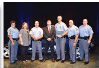
Georgia State Patrol Troop F Third Place