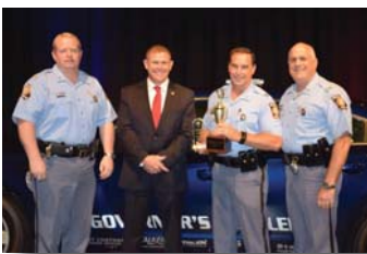
Georgia State Patrol Troop G First Place

During the annual Georgia Governor's Challenge Awards Luncheon on September 30 in Macon, Georgia State Patrol (GSP) Troops and Motor Carrier Compliance Division (MCCD) Regions were recognized for their traffic safety efforts. The awards luncheon is sponsored by the Governor's Office of Highway Safety and is a part of the IACP's NLEC program. Each year three GSP troops and three MCCD regions are recognized for their accomplishments in impaired driving, occupant protection, and speed awareness.