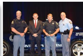
Motor Carrier Compliance Region 9 Third Place