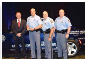
Georgia State Patrol Troop B Second Place