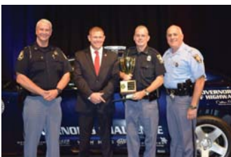
Motor Carrier Compliance Region 8 First Place